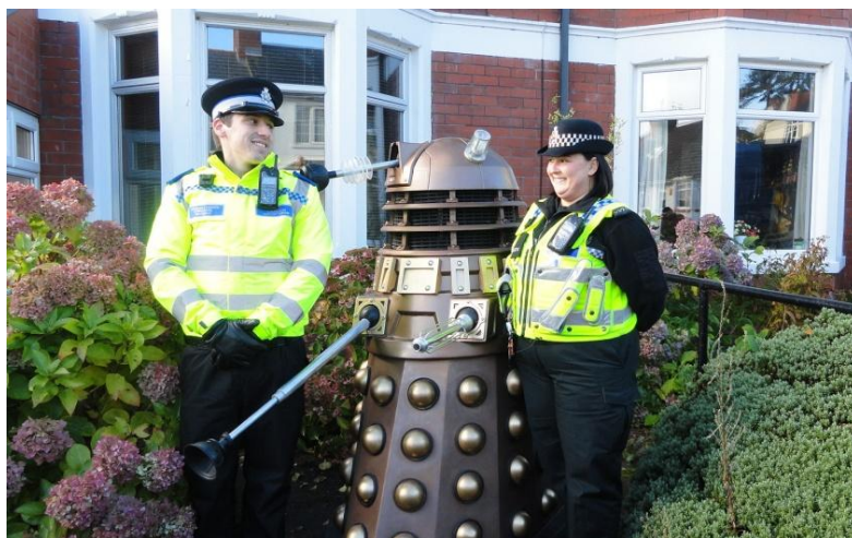
The Dalek has landed in Llandaff!